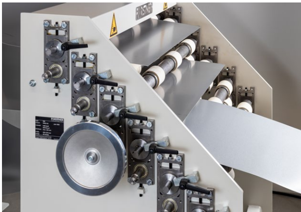
Always ready with a COIL SELECTOR . The COIL SELECTOR is a cost effective solution for fast and simplified manual coil changes. With up to 8 preset materials you can feed your cut-to-length machine in no time.