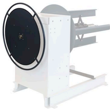
An exquisite accessory for our manual 2-tons decoilers. A larger hand wheel (option) attached to the back of the decoiler that facilitates rewinding of sheet metal. Easily movable between the decoilers.